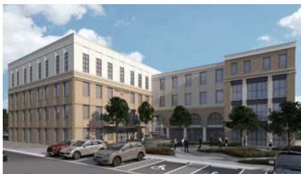
Central Park Bocus Del Toro, Panama