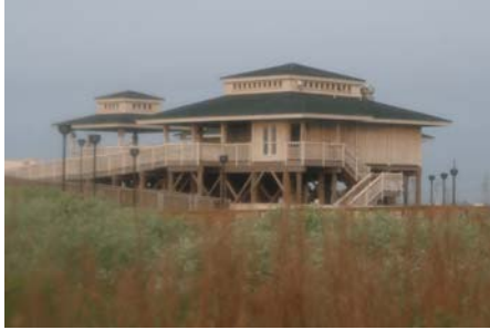
Grace Community Church Clear Lake, Texas