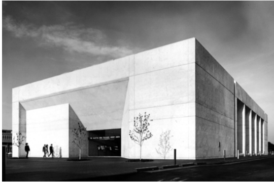
Loop 610 Office Tower Houston, Texas