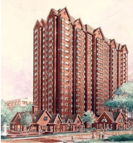
The Forum at Memorial Woods Retirement Center Houston, Texas