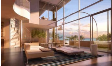
Brazos Oak Retirement Center Bryan, Texas