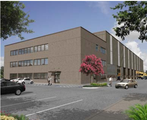
ACCO Material Handling & Processing Facility (2) Houston & San Antonio, Texas