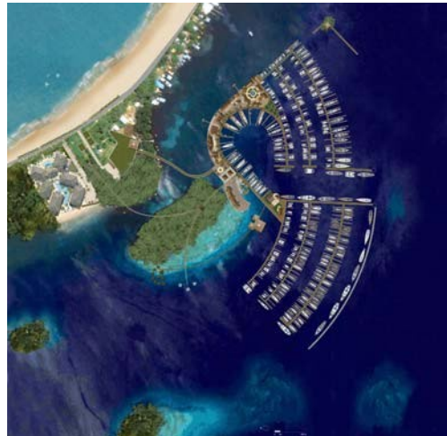
Seabrook Shipyard Master Plan Seabrook, Texas